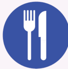
Dining In/Out Events