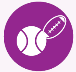
Live Sport Events