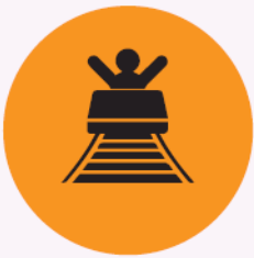
Theme Park Events